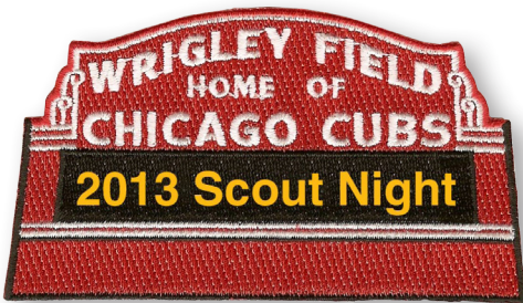
2013 Chicago Cubs Scout Night Patch (colors and design subject to change)

All participants will receive a commemorative 2013 Scout patch. However only the first 1,000 participants will also have the opportunity to run the bases after the game (Weather permitting).